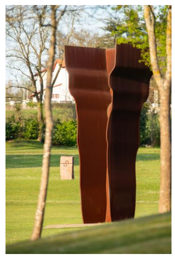
Chillida Leku, Hernani, Guipúzcoa Spain, 1997 Steel 8 x 3 x 3 meters each 22 tons

Chillida made several versions of this work, all of them in the form of stelae that rise towards the sky. Each stela is made up of three asymmetrical steel sheets, so that the sculpture differs depending on the angle from which it is viewed. From the rear one sees an imposing mass, while at the front an empty space invites the onlooker to position themself within the work. Once inside, the high undulating steel walls give dynamism to the work, forcing one to look up in search of light, whether physical, poetic, or spiritual.