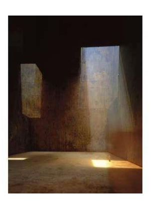
Tindaya Mountain Natural Monument, La Oliva, Fuerteventura, Canary Islands, Spain